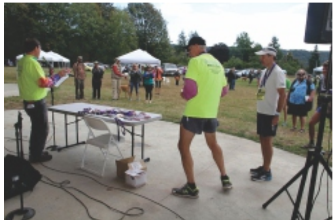
Awards for 5k, 10k, and 1/2 Marathon winners presented