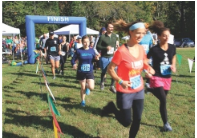
Runners at the start line at Oyster run - 16 September