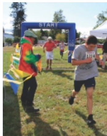
Finished the course!