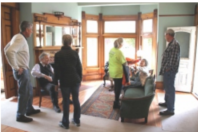
Visitors and volunteers preview living room furniture and artwork