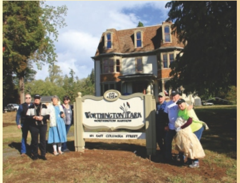
The new landmark mansion sign is unveiled by volunteers and board members at 16 September Open House